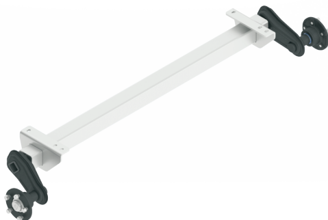
1. Rubber torsion axle

A significant advantage of the solution is also the ability to easily replace the worn bearing pin with the hub and replace them with new elements, thanks to which a significant extension of the life of the independent wheel suspension assembly is achieved.